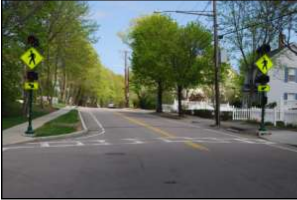
Figure 5: Pedestrian Beacon at Langley Road and Langley Path