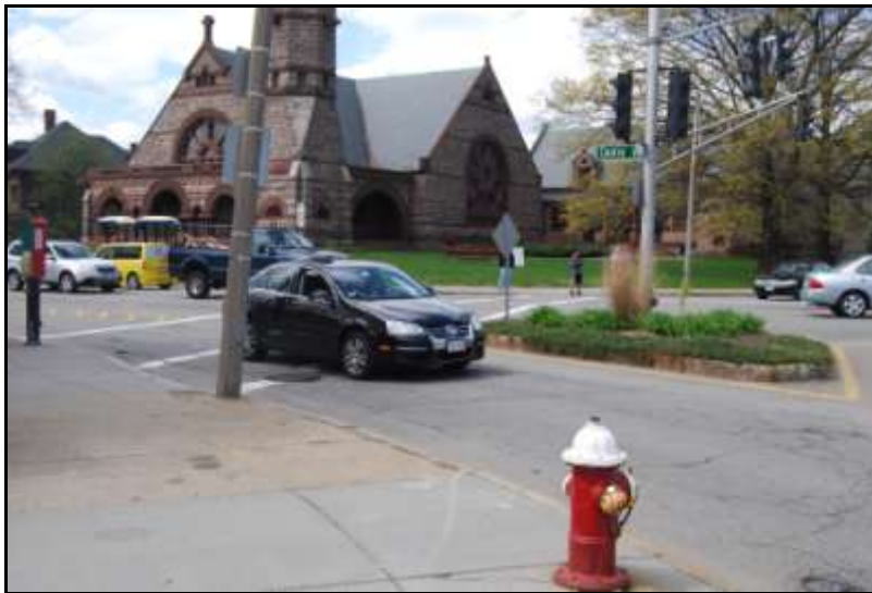
Figure 4: Car making a Right-on-Red at Centre Street and Beacon Street

Recommendation: Install “Leading Interval” traffic lights: Finally, we recommend the installation of leading interval traffic lights that are synchronized with the walking light. Once the walking signal is activated, the traffic signals will be red long enough to provide enough time for a pedestrian to travel half way across the street before letting vehicular traffic start again. This provides a safe way to cross the street and also prevents vehicular traffic congestion by allowing traffic to continue when the pedestrian is using the second half of the crosswalk.