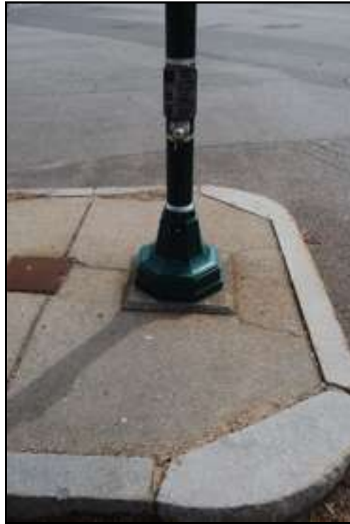
Figure 2: Walking light located on top of an inaccessible median at the intersection of Langley Road and Beacon Street

there are no curb cuts allowing access to the walking light; this prevents people from crossing this street safely. Our recommendations shown below for this challenge are two options that could be implemented: