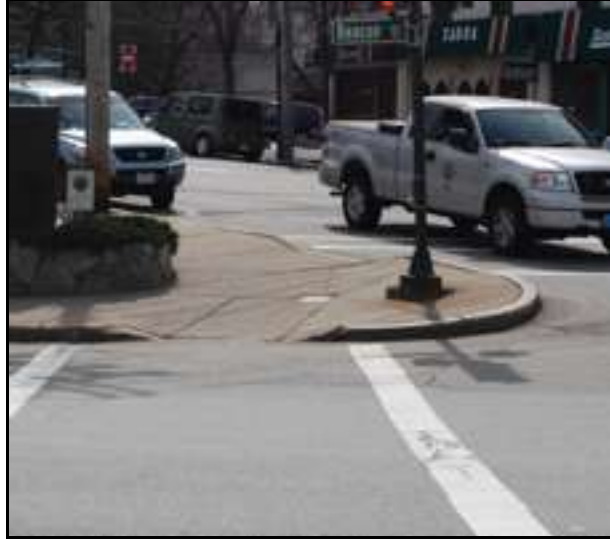
Figure 3: Steep curb cut located at the intersection of Langley Road and Beacon Street

Recommendation: Implement a sidewalk extension into Beacon Street: We recommend implementing a sidewalk extension, known as a “bulb-out”, which would create a shorter distance for pedestrians to travel along the long crosswalk. Also, by creating a larger pedestrian facility, there may be enough room to design a more accessible curb cut in order for people to use the sidewalks in the area.