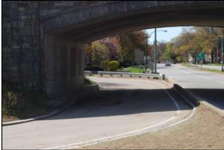
Figure 6: Route 9 Underpass

to the other. These paths are shown in Figure 39. Regardless of where they were traveling, using this underpass is extremely hazardous because it only provides a very narrow place to walk with cars traveling quickly around a sharp corner from Route 9. This area is likely to cause an accident between motorists and pedestrians.