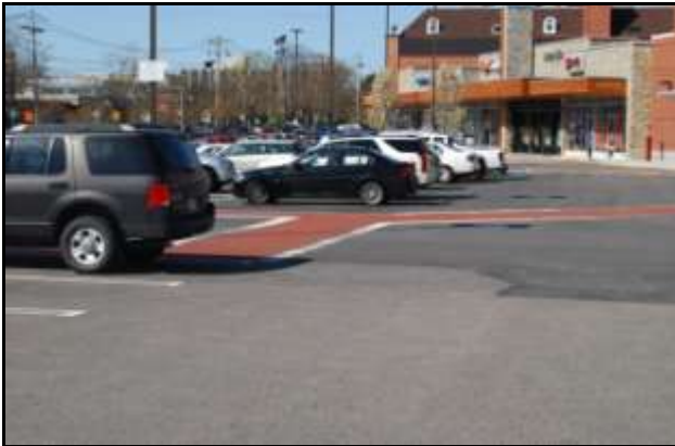
Figure 2: Back entrance to the Mall at Chestnut Hill Shopping Center (left); Crosswalks in Shopping Center Parking lot (right)