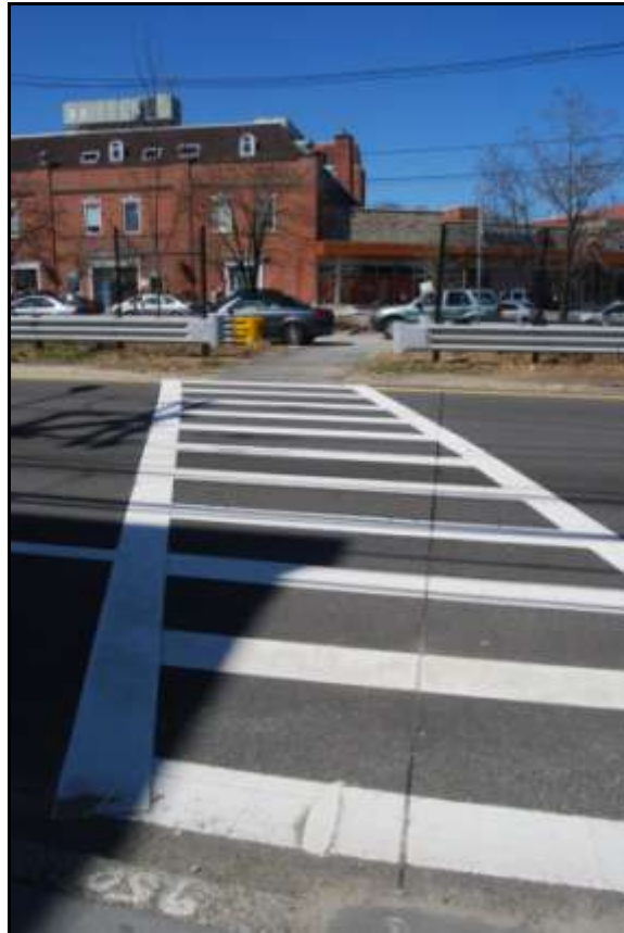
Figure 3: Un-signalized Crossing on Route 9

Recommendation: Implement a walking light. Alternatively, we recommend implementing a walking light, stopping traffic on both sides of Route 9, and allowing pedestrians to cross safely.