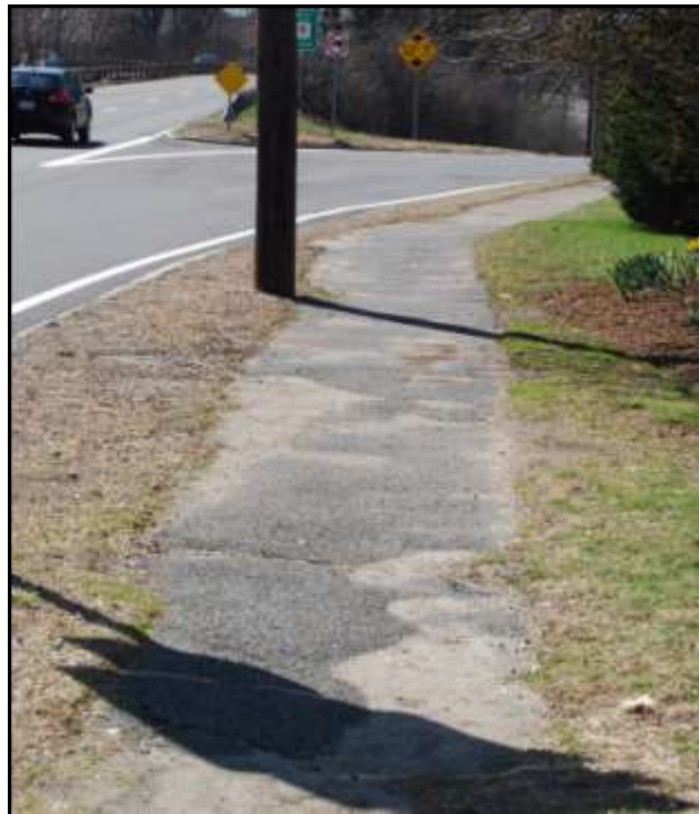
Figure 4: Poorly maintained sidewalk along Route 9 leading to Hammond Pond Parkway

Recommendation: Replace Existing Facilities. We recommend that this sidewalk is replaced and new facilities such as curb cuts and crosswalks are installed with its replacement.