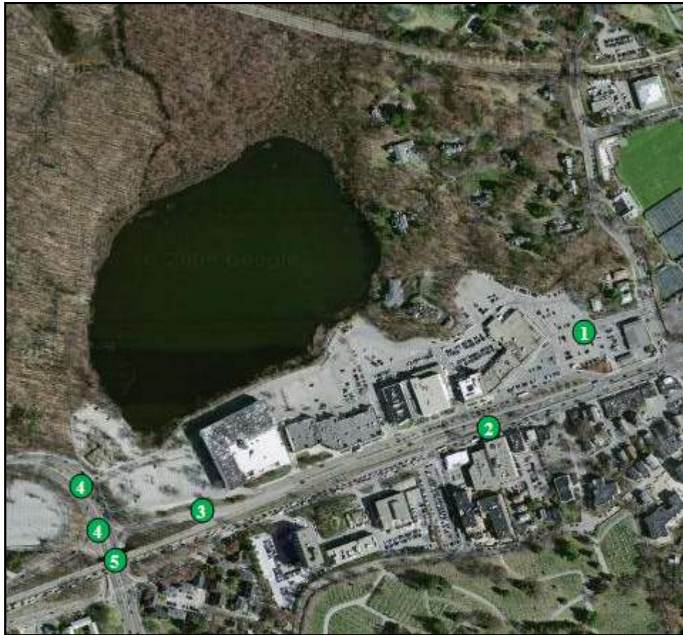
Figure 8: Chestnut Hill Recommendations Map