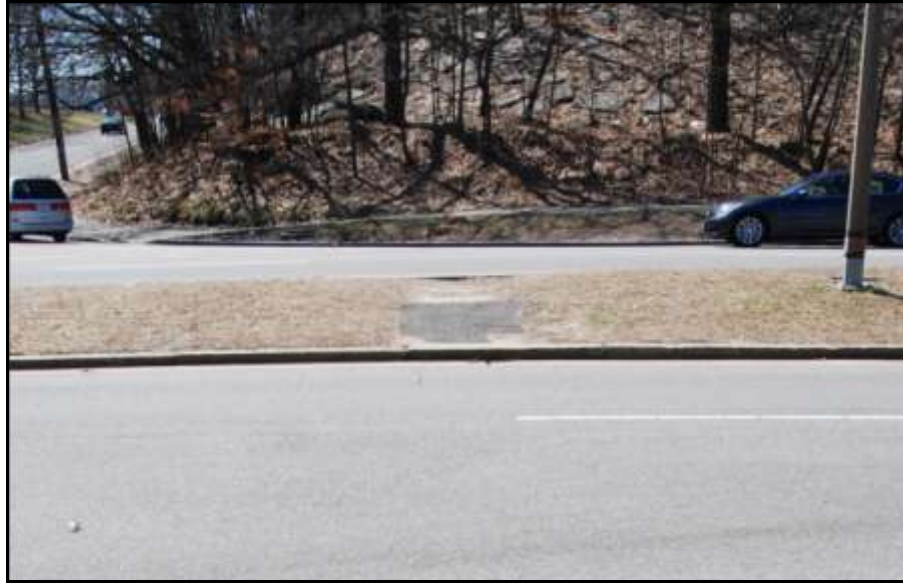
Figure 5: Potential crossing across Hammond Pond Parkway

the facilities seem to suggest a designated crosswalk because of a median with a paved patch of sidewalk. However, there are no crosswalks and no curb cuts leading to the median. This median is shown in Figure 37. As pedestrians cross here, they are presented with fast-moving traffic with poor visibility, putting them in danger.